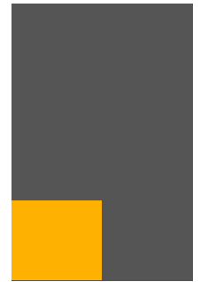
3 col x 4" W 5.083" x L 4"