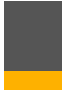
6 col x 3" banner W 10.333" x L 3"