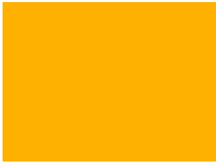
Double Page W 21.333" x L 14"

Below are a few examples of popular ad sizes, shown in orange. Please contact us for additional sizes & costs.