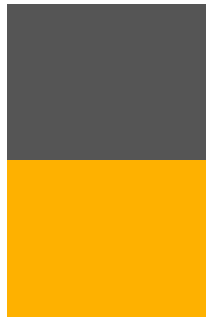
Half Page horiz. W 10.333" x L 7"