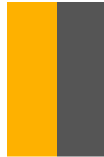
Half Page vertical W 5.083" x L 14"