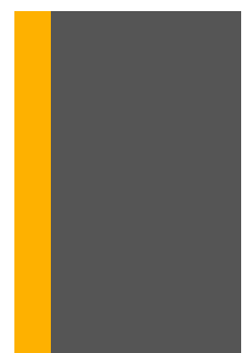
1 col x 14" W 1.583" x L 14"