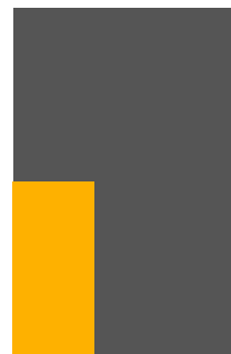
2 col x 7" W 3.333" x L 7"