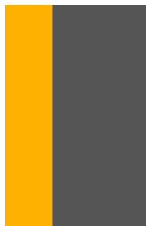
2 col x 14" W 3.333" x L 14"